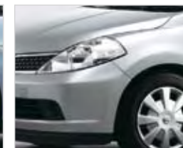
Bright Silver KYO