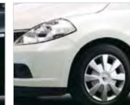
Arctic White QM1