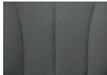
Tricot Cloth Sedan H30

The tasteful, high quality upholstery material covering the comfortable seats is a treat, both to look at and to touch.