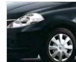
Infinite Black KH3