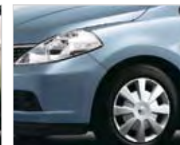
Misty Blue K31