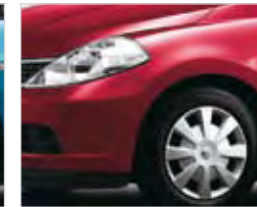
Claret Red AY4