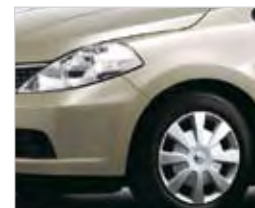
Thermal Gold K32