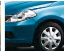
Starling Blue B16