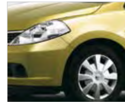
Olive Gold E32