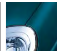
Ocean Blue ZT4