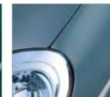
Storm Blue ZBH