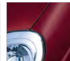
Sherry Red Z24