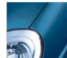
Panorama Blue ZW6