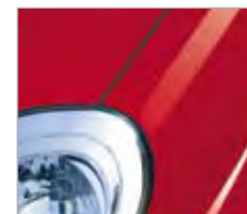
Furnace Red Z35