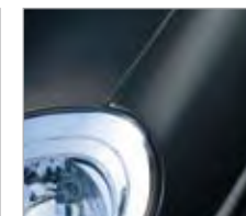
Universe Black Z41