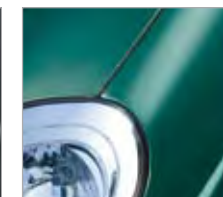
Hydra Green Z42