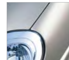
Mercury Silver Z34