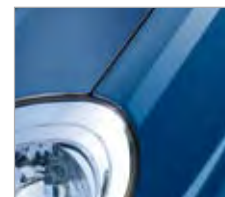
Delta Blue Z39