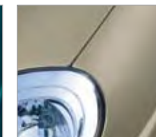
Beige Grey ZT1