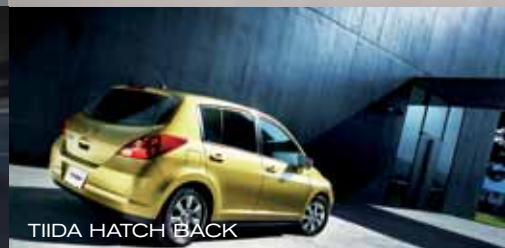
TIIDA HATCH BACK