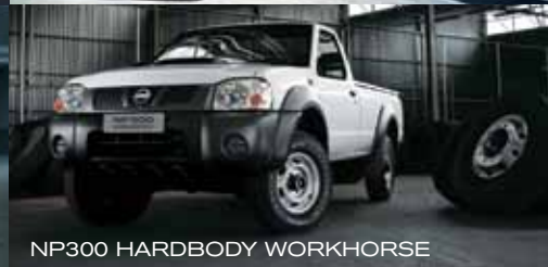
NP300 HARDBODY WORKHORSE

SHIFT_ is an English word from a Japanese car company that best embraces our values and the mission of this corporation. No matter where you are in the world, SHIFT_ is the way we express who we are, how we work and what we are trying to accomplish. Everything we touch, we SHIFT_. And everything we SHIFT_ we try to make better and uniquely NISSAN.