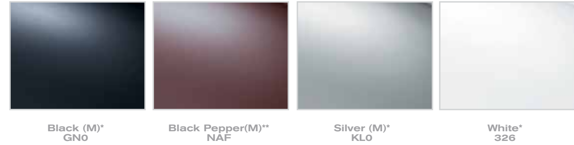
NAVARA (SE & XE) DOUBLE CAB & KING CAB COLOURS