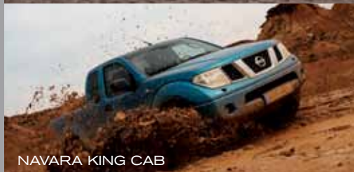
NAVARA KING CAB