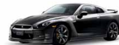
Black Obsidian KH3