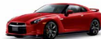
Solid Red A54