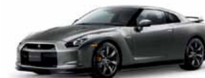
Gun Metallic KAD