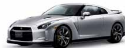
Super Silver KAB