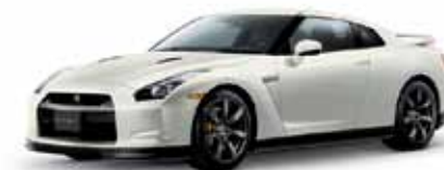
Pearl White QAB